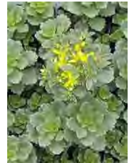
Sedum hybridum 'Immergrunchen'