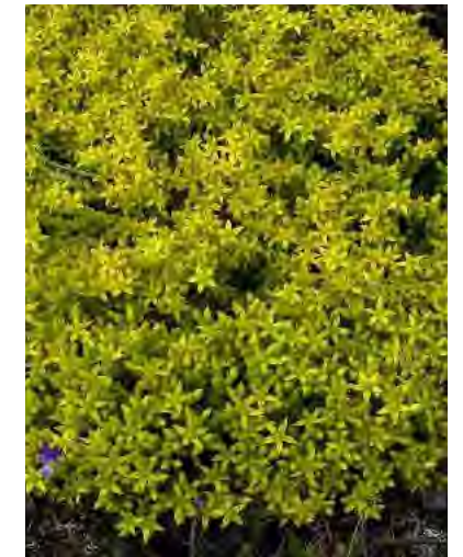
Sedum acre 'Aureum'