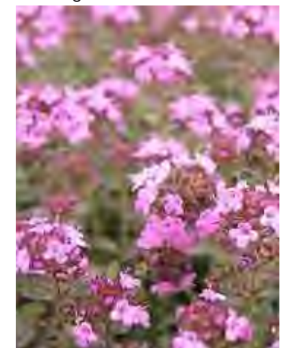
Thymus serpyllum 'Coccineum'