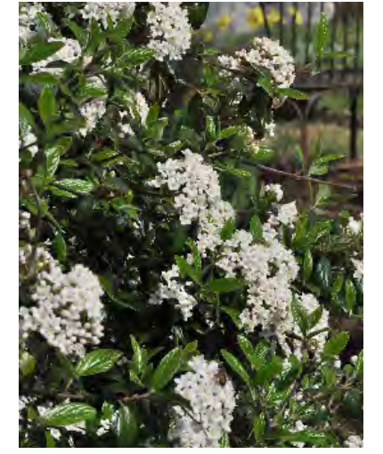
Viburnum x burkwoodii 'Conoy'