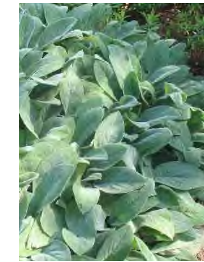
Stachys byzantina 'Helene von Stein'