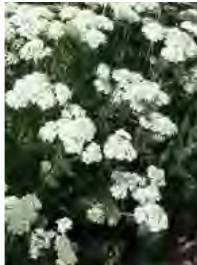
Achillea millefolium x 'Citronella'