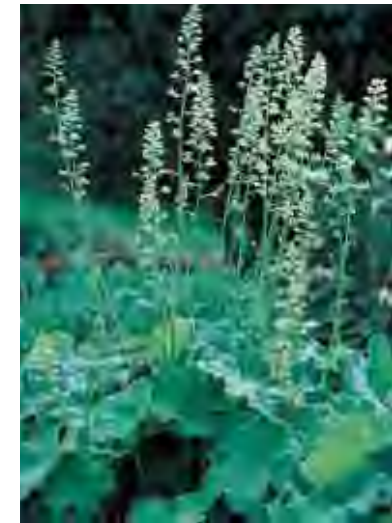
Heuchera villosa 'Autumn Bride'