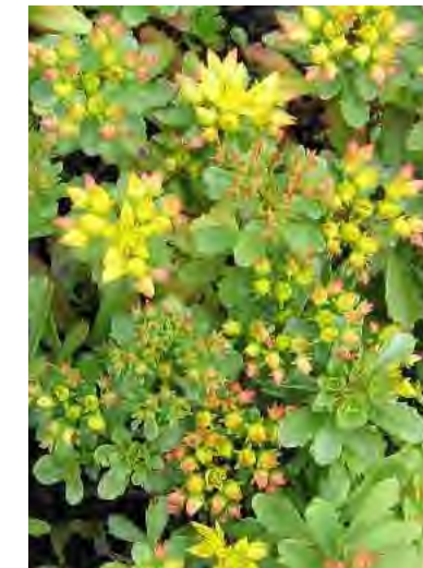
Sedum floriferum 'Weihenstephaner Gold'