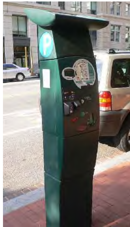
PARKING METER: Multi-space