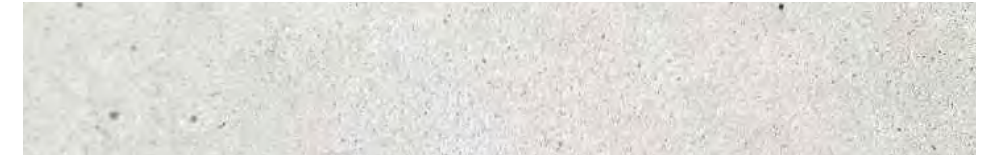
CAST STONE WALL CAPS