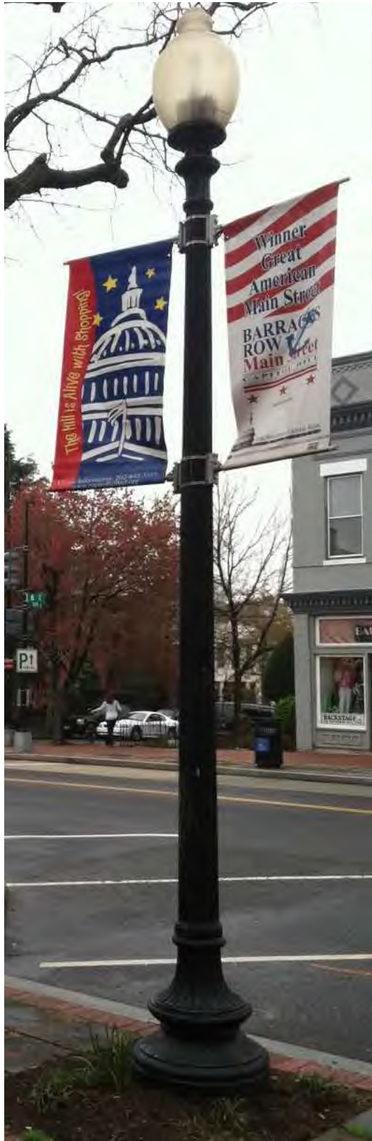
STREET LIGHT: Washington Globe