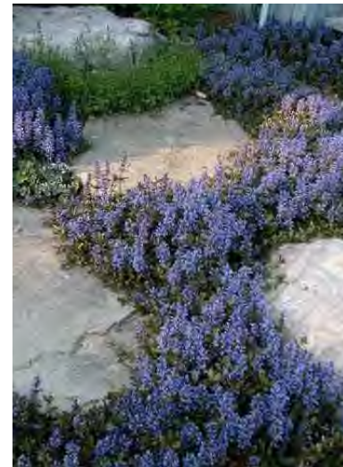
Ajuga reptans 'Chocolate Chip'