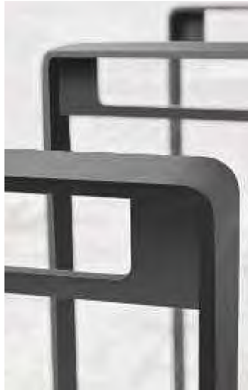
BIKE RACK: Upright, gray