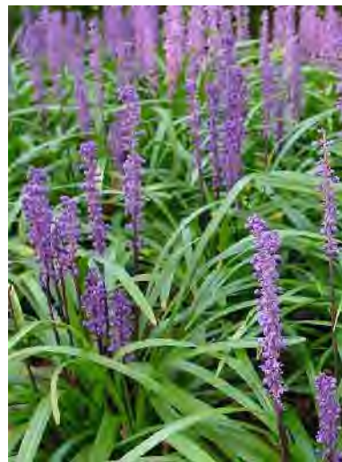
Liriope muscari 'Big Blue'