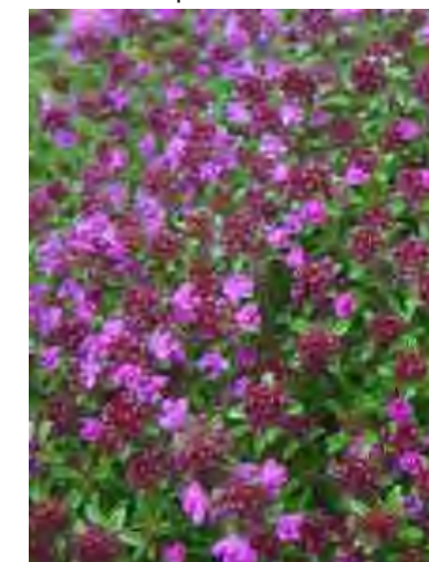
Thymus praecox coccineus