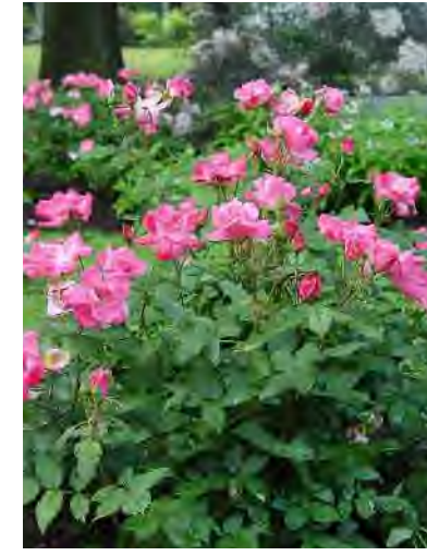
Rosa 'Blushing Knockout'