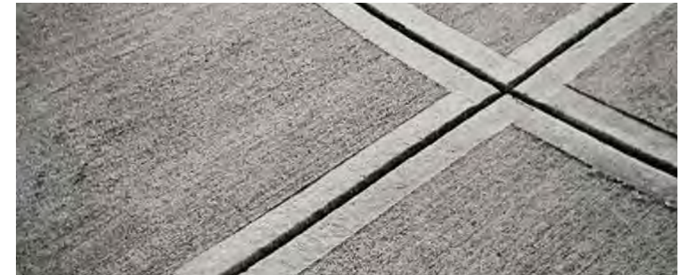
CONCRETE SIDEWALK: 3'x3' Scoring, Hairbrush Finish