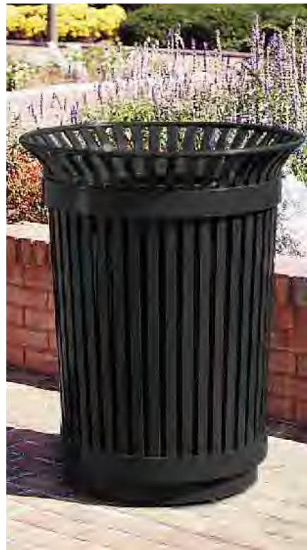
TRASH RECEPTACLE: Traditional, Black