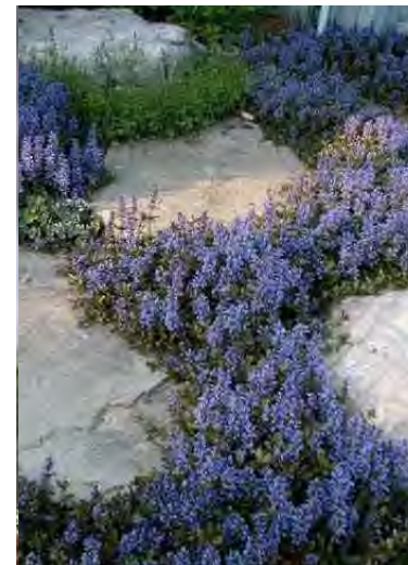
Sedum album 'Murale'