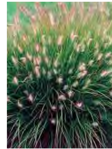
Pennisetum 'Little Bunny'