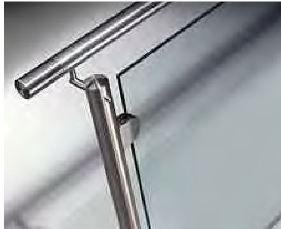
HANDRAIL/GUARDRAIL: Stainless Steel, with optional inlay panel