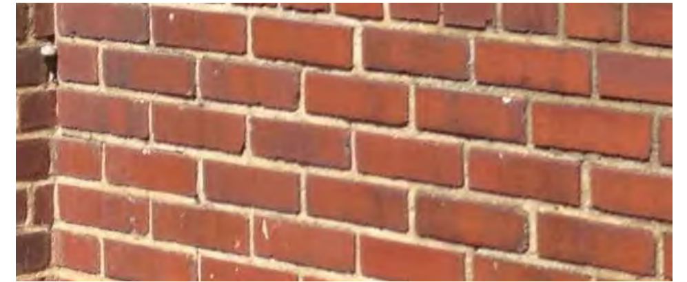
RECLAIMED BRICK PLANTER WALLS